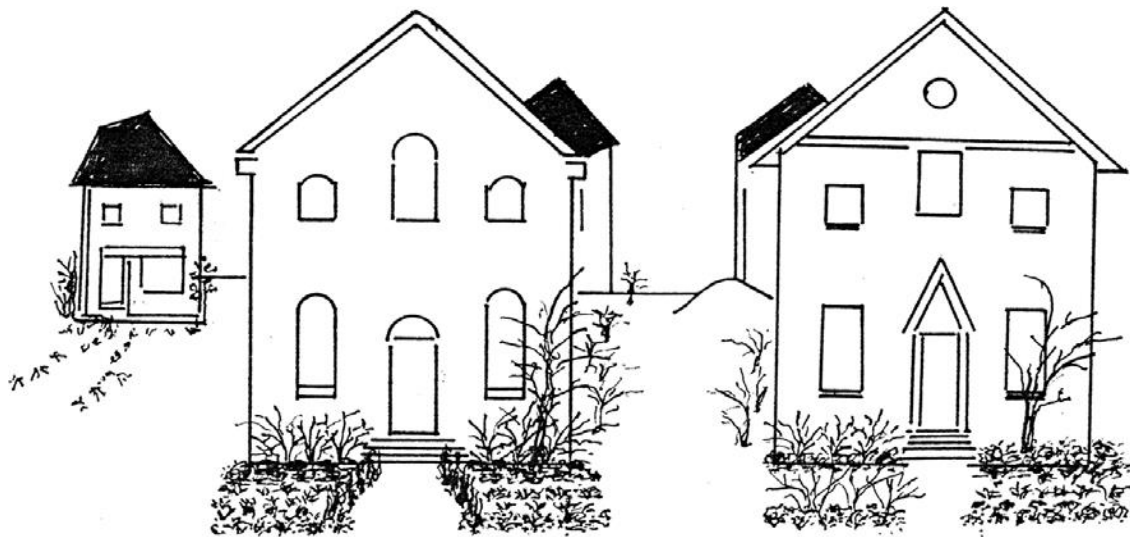
A landscape that looks right now...just planted.

Over the past few years, I have been called upon to consult at several relatively new landscape projects. The first one, a planned mixed-use residential community, had quite a nice plant palette. It was a mix of sturdy groundcovers, deciduous and evergreen, drought-tolerant shrubs, some natives, good trees, and a few not-too-onerous ornamental grasses and perennials. Although the beds were roomy, the plants were all crowded next to the edges, where they would, and did, interfere with foot traffic, signage, and parked cars. The result was that the landscape crew was forced to shear the shrubs. What really killed me was that this landscape design actually won awards. My only explanation is that perhaps a well-meaning installation crew mis-sited the shrubs in an attempt to make it look finished now . The same plants and numbers of plants, if correctly spaced and sited, would last for thirty years, as all good landscapes should. I wound up telling the crew that they would have to dig up and rearrange almost all the existing plants in the fall and winter. Given tight maintenance budgets, what are the chances that will happen?