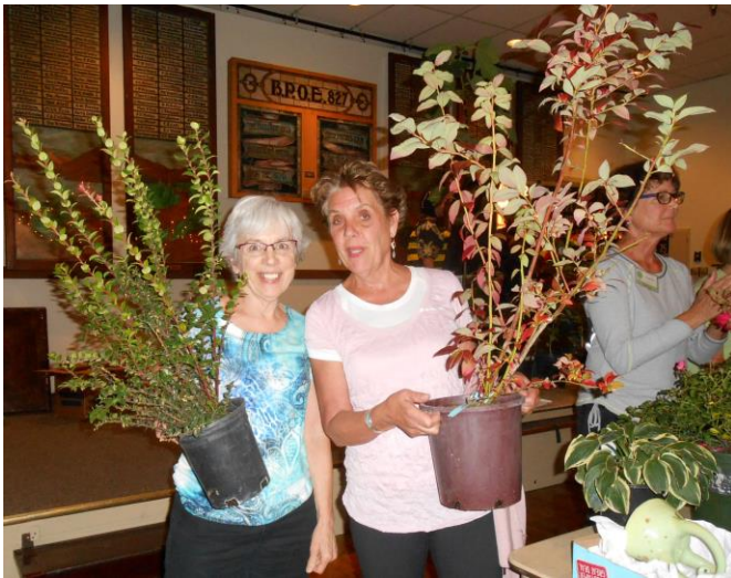
Happy Winners at Tree Hugger Bingo

Most of our funding comes from membership dues and donations from members, including the GiveBIG Fund Drive in May (netting about $12,000), the Arborist Donated Work Day in December and the Annual Appeal (i.e., The Begging Letter) in December; many thank you’s to our dedicated members for their support each year. We also earned money from our fabulous annual events: Bingo, the Garden Tour, and the Sky Nursery Prune-a-thon.