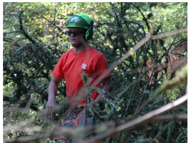
A Dedicated Pruning Assessment at Rhody Ridge.

Arbor Day pruning took place in Snohomish County this year.