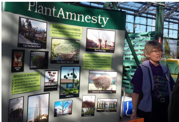
PlantAmnesty at Sky Prune-a-Thon

We staffed six booths at various events, talking to an estimated 1,000 people with pruning questions and needs. One hundred and nineteen volunteers spent 388 hours setting up and staffing booths. Boothing venues included Northwest Flower & Garden Show, Prune-a-thon at Sky Nursery, Washington Native Plant Society Fall Plant Sale, Master Gardener Spring Plant Sale, Green Gardeners Workshop, and the Seattle Tilth Harvest Fair.