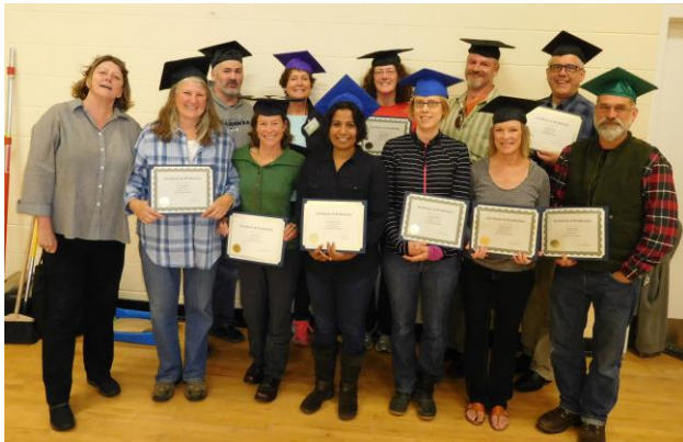
PlantAmnesty's 2015 Master Pruner Graduates

We graduated 25 Master Pruners—from the PlantAmnesty classes at Magnuson Park and the Center for Urban Horticulture Series - all of whom will carry on our mission.